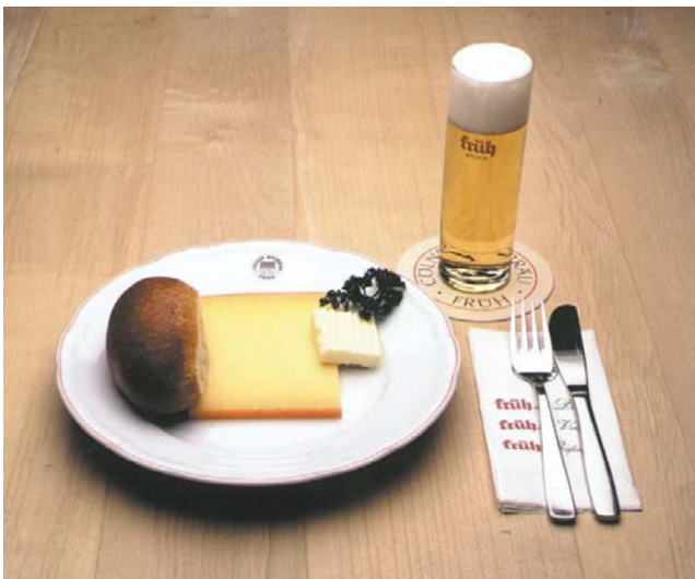
Kölsch and "halver Hahn" – your standard meal in Cologne

Registration includes also subscribing for the different company visits and seminars – first come, first serve. Payment can be made via Credit Card or on the spot.